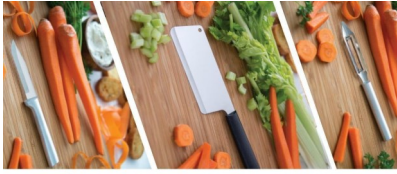
CUTLERY BETTER BUILT RADA CUTLERY